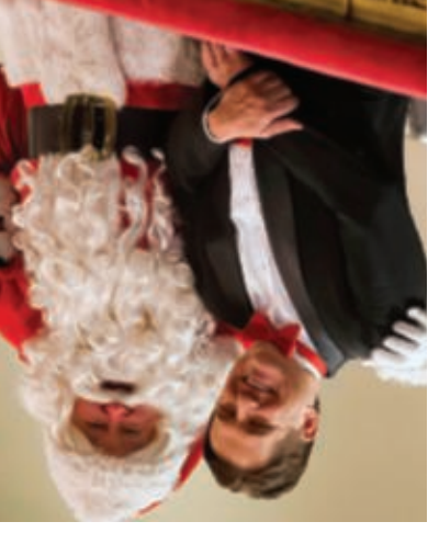
KEITH LOCKHART CONDUCTOR